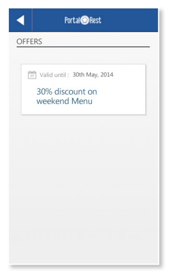
Book it on-line