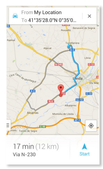
Find your restaurant easily